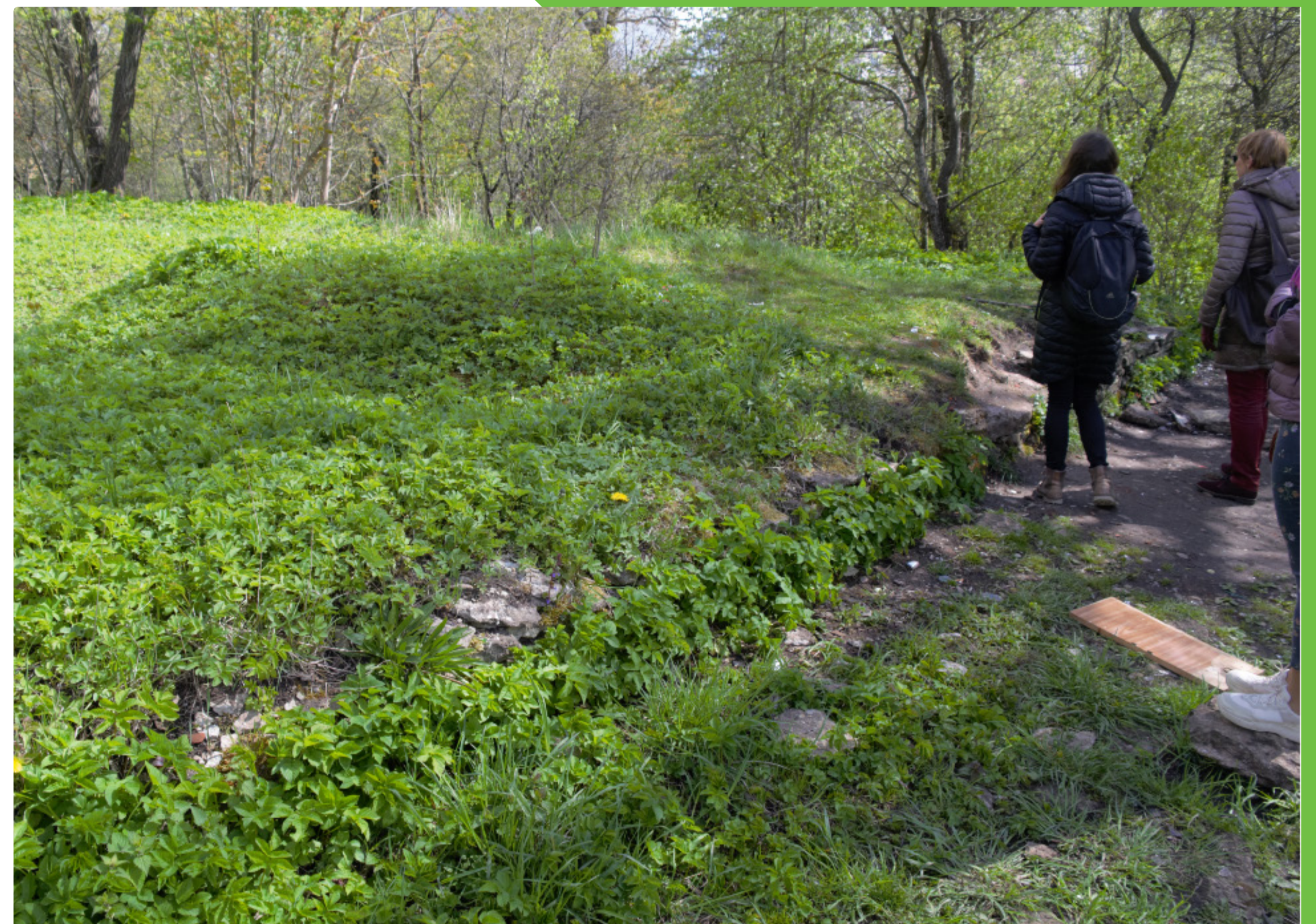
Tallinn's proposed target area for its GoGreenRoutes intervention is the Vormsi park, located in Lasnamäe, the biggest residential district of the city

Vormsi park is a green area of great ecological and cultural value. Despite its potential to increase social interactions and enhance people's connection to nature, the park is currently underused and neglected. GoGreenRoutes' Nature-based Interventions (NBS) in Vormsi aim to preserve and delicately redesign existing urban wilderness areas while actively engaging local residents through various community activities. Join our local task force and help shape our future green interventions, which may include a community garden, green walls, the restoration of natural vegetation and the establishment of a natural water drainage system.