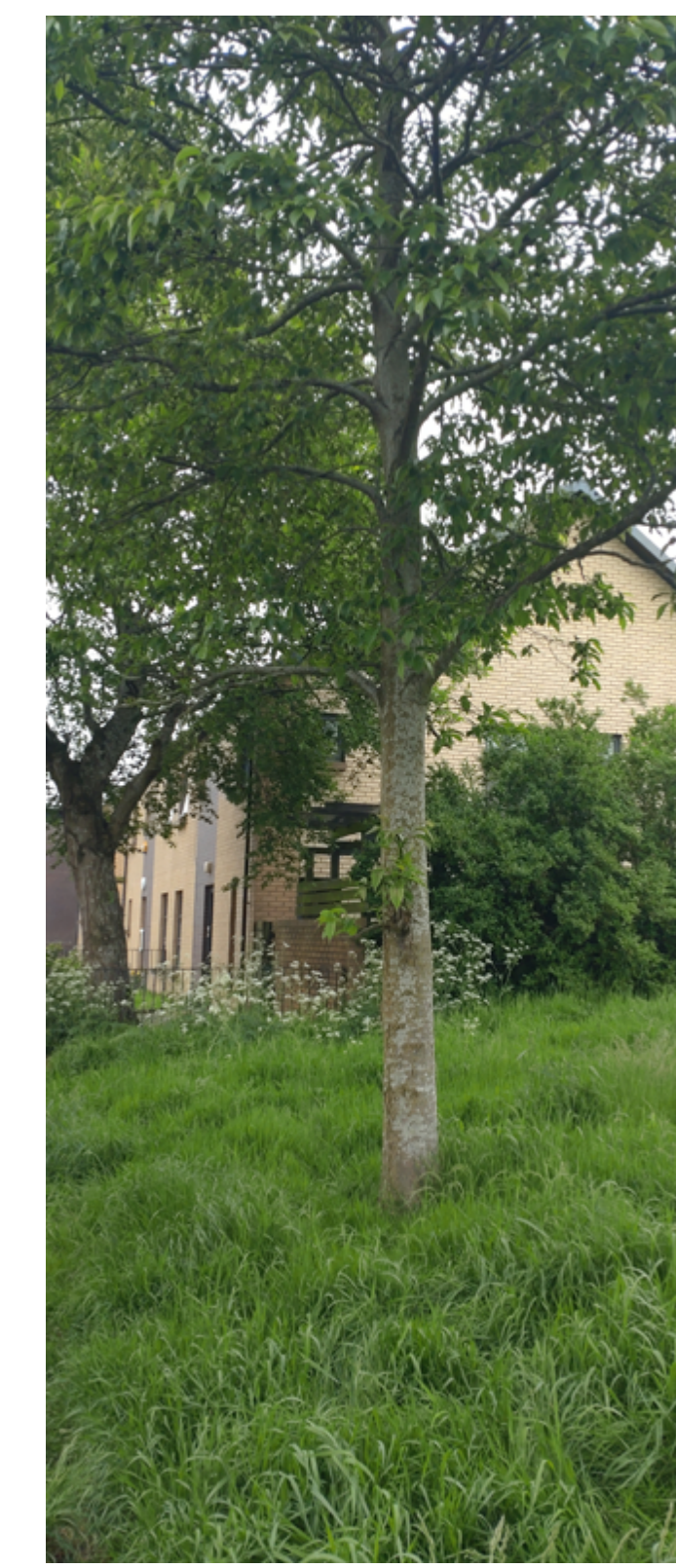
Kerb side NBS to slow water flow and provide shelter