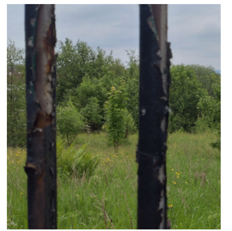
Abandoned development site that has been temporarily planted

Milton Placestandard review of how the open spaces and Vacant / derelict land contributes to the lived experience within Milton. Focused on the interventions of the Milton Community Hub, Milton Community Garden and small pocket parks between the community hub and the retail hub. Interventions have been both council and community led but there are still large areas of stalled sites and limited good quality connections between the existing NbS.