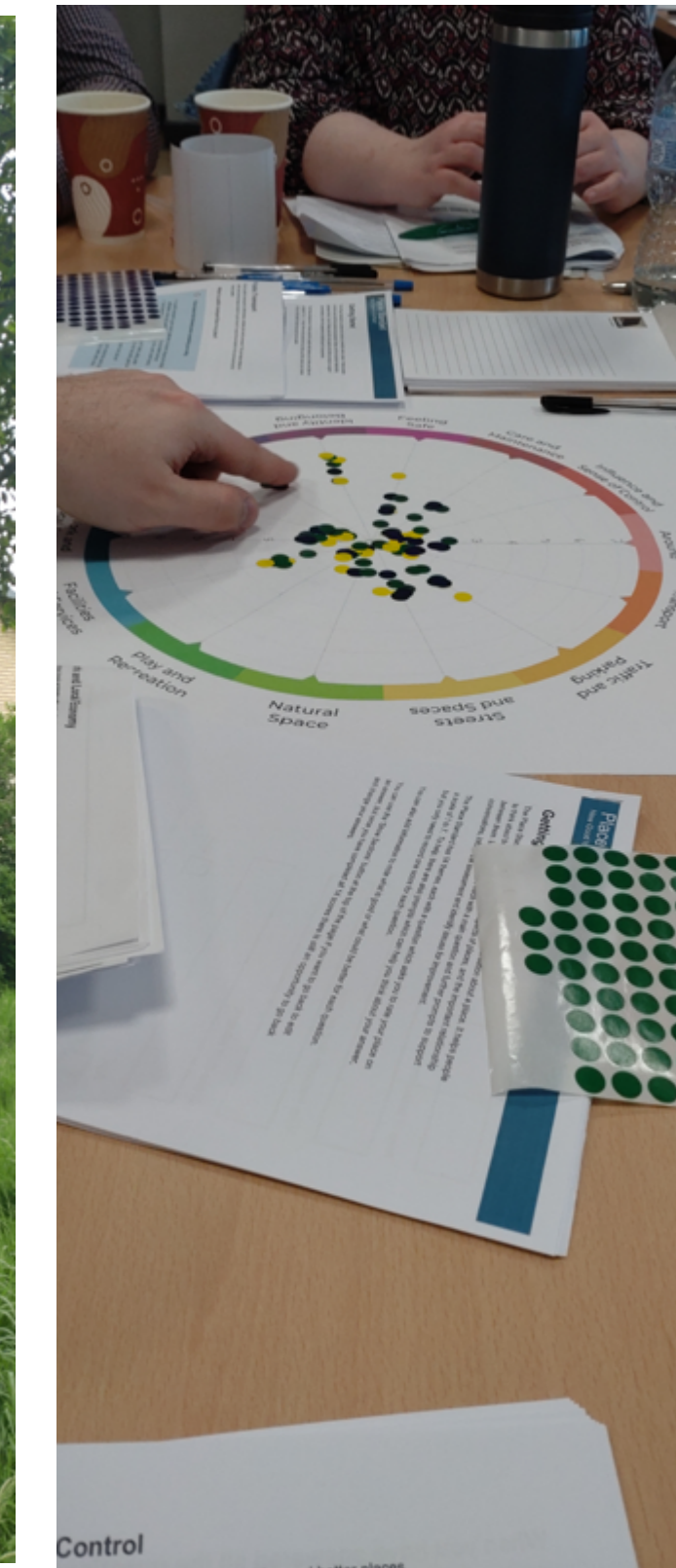
Participants were asked to rate the experience of using the space on a scale of 1 to 7.

Milton Placestandard review of how the open spaces and Vacant / derelict land contributes to the lived experience within Milton. Focused on the interventions of the Milton Community Hub, Milton Community Garden and small pocket parks between the community hub and the retail hub. Interventions have been both council and community led but there are still large areas of stalled sites and limited good quality connections between the existing NbS.