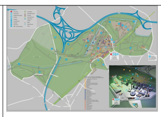
Fig. 2: Map of Landscape Park Duisburg-North